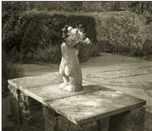
PHOTO GUILD HOSTS ENGLISH GARDEN EXHIBIT IN MSUM LIBRARY

*indicates item can be viewed electronically at: http://www.mnstate.edu/acadaff/APAC/2005-2006APAC/APACAgendasMinutes.htm