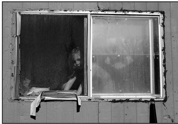
Mora, Minnesota