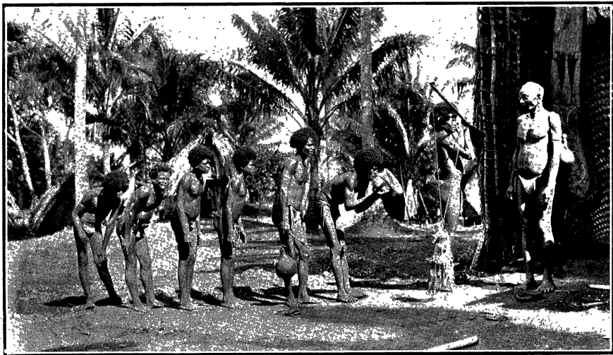
AN EPISODE IN THE INLAND KULA : OFFERING A NECKLACE (SOULAVA) TO A CHIEF.

KULA; THE CIRCULATING EXCHANGE OF VALUABLES IN THE ARCHIPELAGOES OF EASTERN NEW GUINEA.