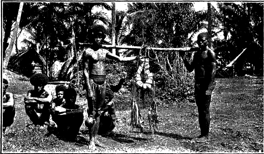
ARMSHELLS CEREMONIALLY BROUGHT INTO OMARAKANA VILLAGE FROM A SMALL EXPEDITION TO KITAVA.

The Kula has been called above "a form of trade." The usual a priori notion of savage trade would be that of an exchange of indispensable, or, at least, useful