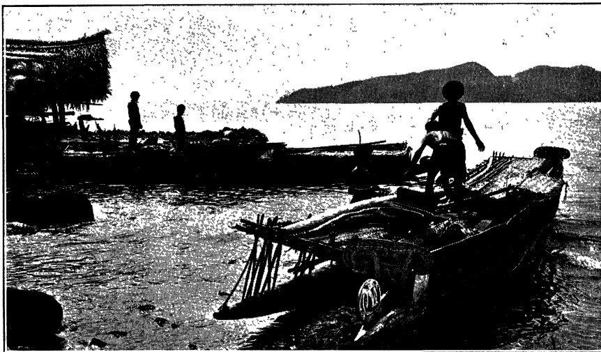
LOADING LARGE CLAYPOTS IN THE AMPHLETT ISLANDS, IN CONNECTION WITH THE KULA .

This does not exhaust the subtleties and distinctions of Kula gifts. If I, an inhabitant of Sinaketa, happen to be in possession of a pair of armshells more than usually good, the fame of it spreads. It must be noted that each one of the first-class armshells and necklaces has a personal name and a history of its own, and as they all circulate around the big ring of the Kula , they are all well known, and their appearance in a given district always creates a sensation. Now all my partners—whether from overseas or from within the district—compete for the favour of receiving this particular article of mine, and those who are specially keen try to obtain it by giving me pokala (offerings) and haributu (solicitory gifts). The former ( pokala ) consists, as a rule, of pigs—especially fine bananas and yams or taro; the latter ( haributu ) are of greater value: the valuable "ceremonial" axe blades (called beku ) or lime-spoons of whale's bone are given. There are further