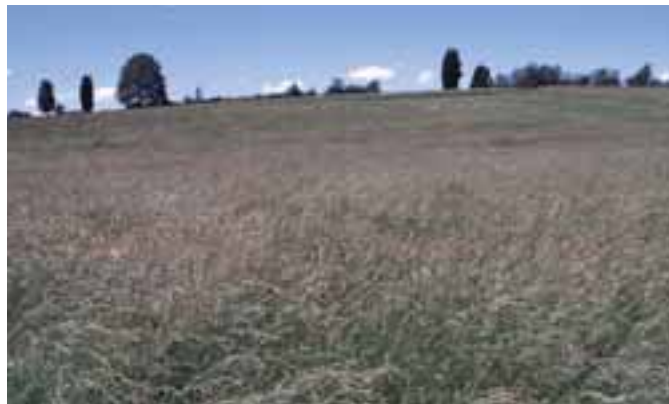
Fields of tall fescue are common throughout the Mid-South. This is poor wildlife habitat and, for many species, it might as well be covered in asphalt.

There are many problems associated with tall fescue and other perennial cool-season grasses, both for wildlife and livestock. Problems for livestock are associated with an endophyte fungus found within tall fescue that is highly toxic. Cattle consuming tall fescue (either grazing or as hay) often experience poor weight gains, reduced conception rates, intolerance to heat, failure to shed the winter hair coat, elevated body temperature and loss of hooves. Problems with horses are more severe, especially 60–90 days prior to foaling. Fescue toxicity in horses often leads to abortion, prolonged gestation, difficulty with birthing, thick placenta, foal deaths, retained placentas, reduced (or no) milk production and death of mares during foaling. As a forage, tall fescue and other perennial grasses (e.g., orchardgrass) are