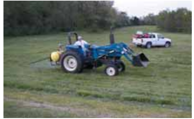
Herbicide applications are often necessary when establishing nwsg. Existing sod must be sprayed before planting. Pre-emergence applications are usually necessary at planting. Post-emergence applications are often necessary for adequate weed control.

Roundup ♦ -only applications in the spring have been less than successful. However, by tank-mixing 2 quarts of Roundup ♦ with 8 ounces of Plateau ♦ and 2 pints of Methylated Seed Oil (or 22 ounces of Journey ♦ with 1 1/2 quarts of Roundup ♦ ), a spring herbicide application can be successful. Before existing sod is sprayed, the field should be burned, hayed, grazed or mowed and allowed to re-grow 6–10 inches. This ensures the herbicide comes in contact with an actively growing plant, not dead thatch from the previous year's growth. After killing cool-season grasses, expect warm-season competitors (e.g., johnsongrass, crabgrass) to emerge from the seedbank.