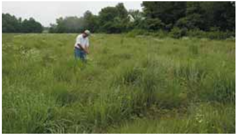
Short mixtures of nwsg usually are dominated by little bluestem, broomsedge and/or sideoats grama. These stands can provide excellent cover for nesting, brooding and foraging.

Species and mixtures for livestock forage are generally determined by preference and potential problems with competitive weeds. For example, pure stands of switchgrass or eastern gamagrass can provide excellent forage for livestock. However, if crabgrass and/or johnsongrass are prevalent, a mixture of big and little bluestem and indiangrass might be a better choice, because an imazapic herbicide can be used to help ensure successful establishment.