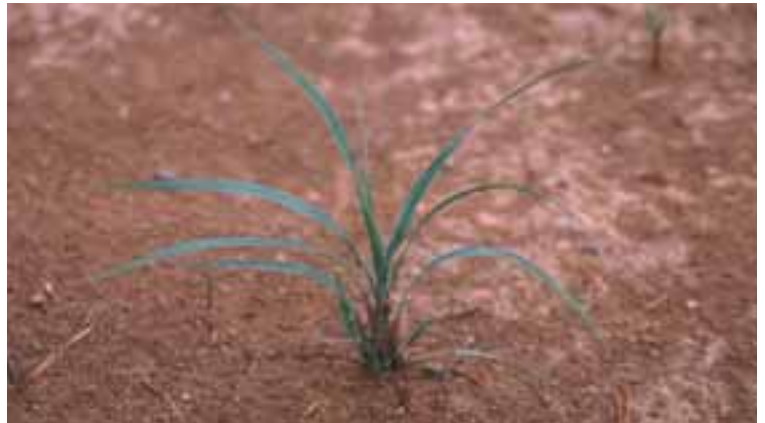
This is what you are looking for! This is a big bluestem seedling with its characteristic “fountain” appearance. Note the bare ground and lack of weeds germinating around the seedling. This is what should be expected from a properly applied pre-emergence herbicide.

Nwsg develop relatively slowly during the year of establishment. Most of the first-year plant growth is root development. Leaf and stem growth may not reach more than 2 feet high by the end of the first growing season. Typically, it is not until the second growing season that most nwsg develop considerable aboveground biomass, flower and produce seed. However, if the correct planting procedures are followed and soil moisture is not limiting, excellent growth will occur during the year of establishment, with considerable aboveground biomass and extensive flowering.