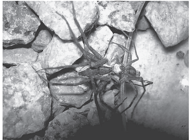
Figure 3. Female (left) and male (right) in the face-to-face position grasping the gift, during mating.

The presence of nuptial gifts in P. ornata enhanced male mating success and increased copulation duration, in agreement with reports for gift-giving insect species (Sakaluk 1984; Thornhill 1976b; Simmons & Gwynne 1991; Vahed 2007). Our