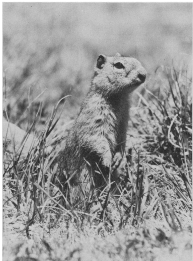
Fig. 1. Belding's ground squirrel at Tioga Pass, Mono County, California.

During 3082 hours of observation, members of five species of terrestrial predators and marked ground squirrels of known age were seen simultaneously 102 times: long-tailed weasels ( Mustela frenata ) 67 times, badgers ( Taxidea taxus ) 11 times, dogs ( Canis familiaris ) unaccompanied by humans 11 times, coyotes ( Canis latrans ) 10 times, and pine martens ( Martes americana ) 3 times. On these occasions nine ground squirrels (six adults and three juveniles) were killed (that is, one was killed every 342 observation hours): two by pine martens, three by coyotes, and four by long-tailed weasels. I use these observations to discriminate among hypotheses 1 to 6 for this species' alarm call.