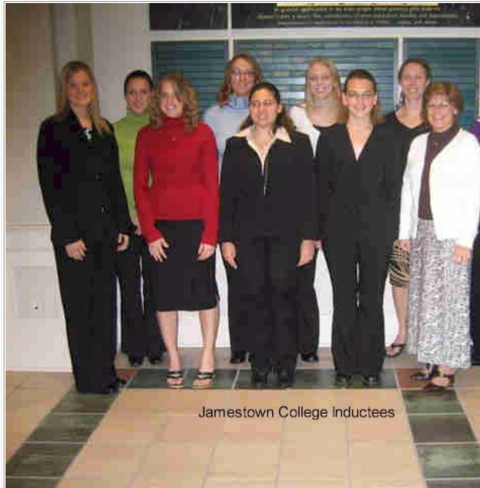
Jamestown College Inductees