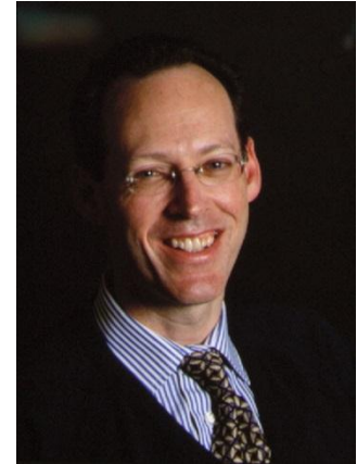
Dr. Paul Farmer