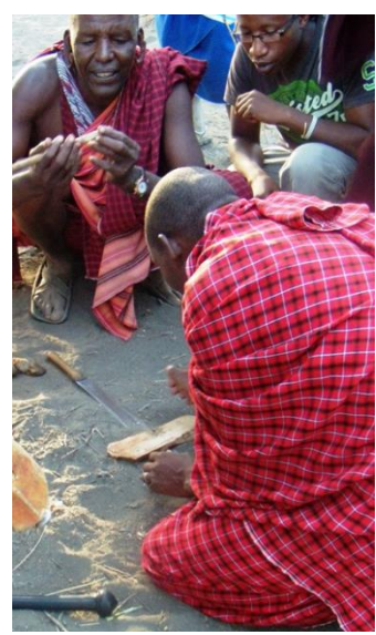
Maasai moran starting a fire